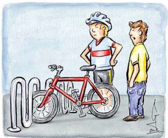
"I guess it's time to get a new bike when they steal your lock, but leave the bike."

You can buy this and other cartoons by going to www.junkertoons.com